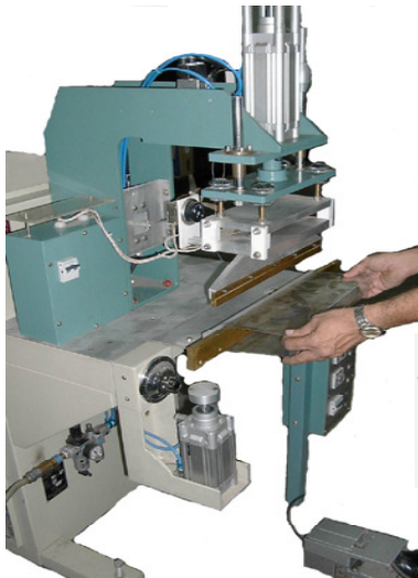
Sheet Welding with Sleeveboard under-electrode and Cylinder as mechanical Support

* You save 50% on workforce because it is useless to adjust Settings each time you change electrodes or products.