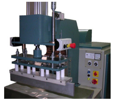
Commands and Settings Panel

All applications according to your Products on Request